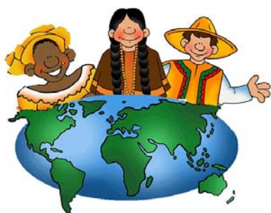
BUMC Summer Music Arts Week:

Community and World: For our country's leaders, and those in North Korea and around the world, that they make wise decisions that lead to peace; for all the immigrants who are afraid of being deported from our country; that our church, along with other non-profits, will find ways to bring about Justice for all, during this stressful time in our country and world. Let us be the change in racial issues, homelessness, immigration, health issues, and making sure every child goes to school.