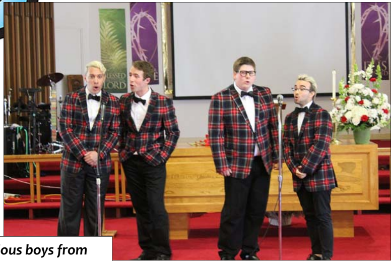
The marvelous boys from Forever Plaid!